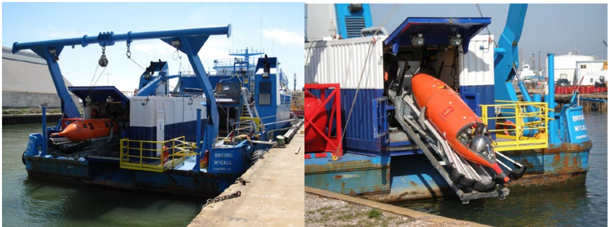
Figure 1. DOFSubsea's AUV on the stern of the BMCC (a) and being test deployed dockside (b).

DOFSubsea successfully tested and demonstrated the performance of their AUV system on the BMCC and then successfully conducted a project for a deep-water Gulf of Mexico operator.