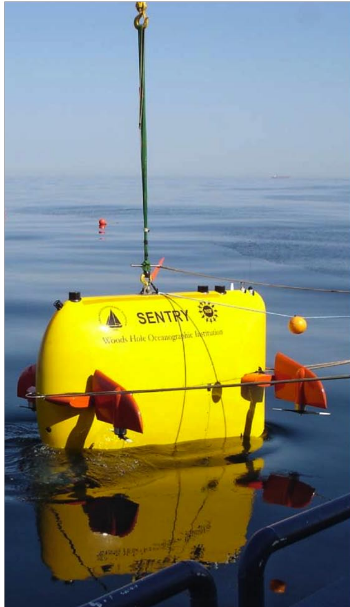
Figure 3. AUV Sentry will be deployed on the BMCC in June 2009 for a MMS deep-water Lophelia-II study of reefs and wrecks.